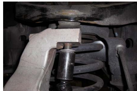
10. Loosen upper ball joint nut and break loose with hammer.

Break loose tie rod/upper ball joint No photo