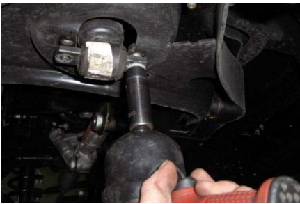
7. Disconnect lower shock mounting bolts.