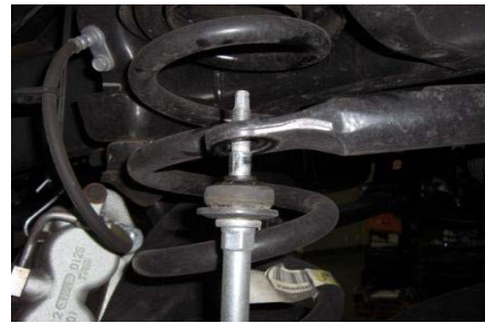
8. Disconnect upper sway bar end links and bushings.