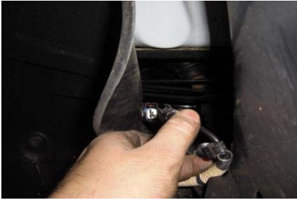
5. Disconnect ABS line at or behind fender liner.