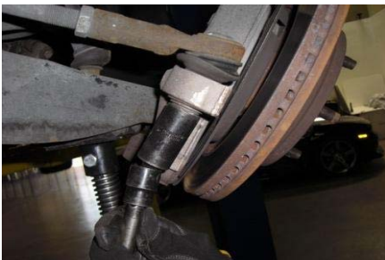
9. Disconnect tie rod end nut and break loose with hammer.