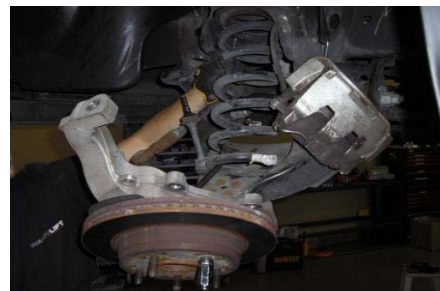
12. Slowly lower suspension and remove coil spring.