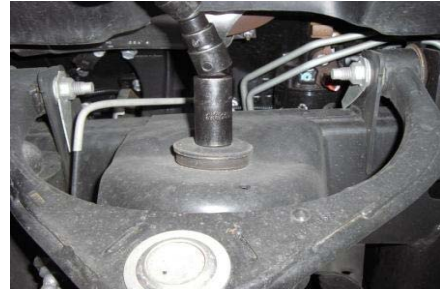
6. Disconnect upper shock mount and bushing.