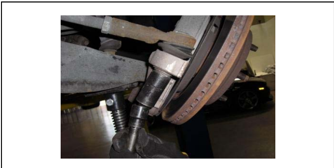
9. Disconnect tie rod end nut and break loose with hammer.