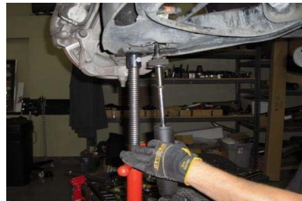
18. Reuse OE bushings and hardware top and bottom.