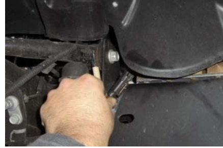
22. Reconnect ABS lines.

Torque all hardware to factory spec and recheck to ensure there is proper clearance and slack for ABS lines to travel through entire suspension range. Reinstall and torque wheels and tires, test drive and have vehicle aligned.