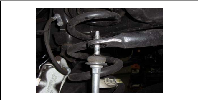
8. Disconnect upper sway bar end links and bushings.