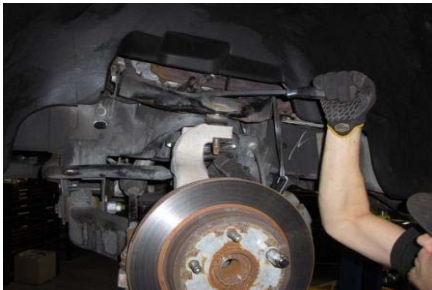
15. Lift suspension enough to engage upper ball joint.