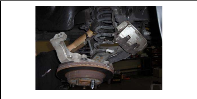
12. Slowly lower suspension and remove coil spring.