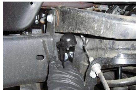
20. Pass/Dr side brackets are specific. Tighten once aligned.