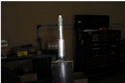
17. Install and tighten new upper shock extension.