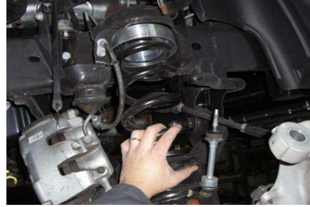
14. Reinstall spring and properly clock in lower control arm.