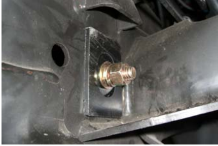
21. Picture shows inner frame bracket & hardware installed.