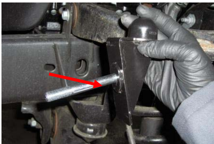
19. Attach new bump stop and bracket to frame as pictured.