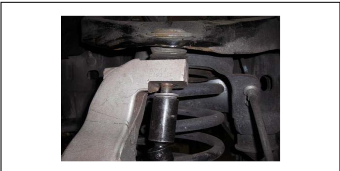
10. Loosen upper ball joint nut and break loose with hammer.

Break loose tie rod/upper ball joint No photo