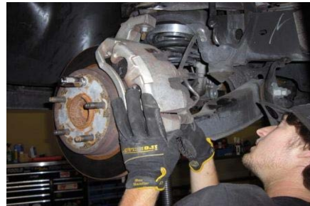
16. Reconnect brake calipers, sway bar links, and tie rods.