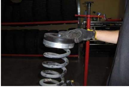
13. Remove upper isolator and replace with new spacer.