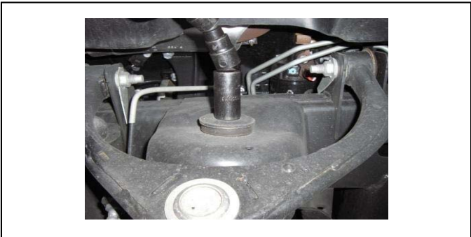
6. Disconnect upper shock mount and bushing.