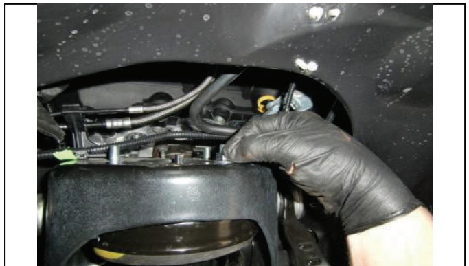
Bolt strut assembly into original position with new hardware