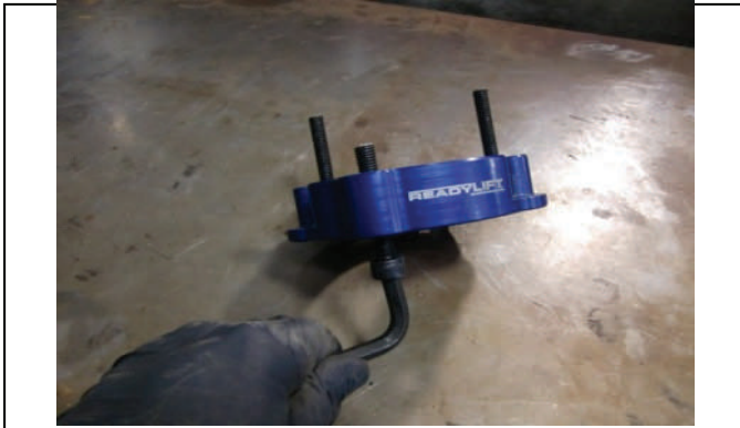
Shown T6-2055 , screw bolts into spacer and torque