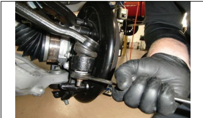
Loosen outer tie rod nut and leave connected.