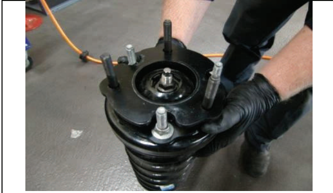
Remove cast spacer and mount new spacer w/OE nuts.