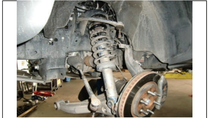
Support suspension and remove lower control arm bolts