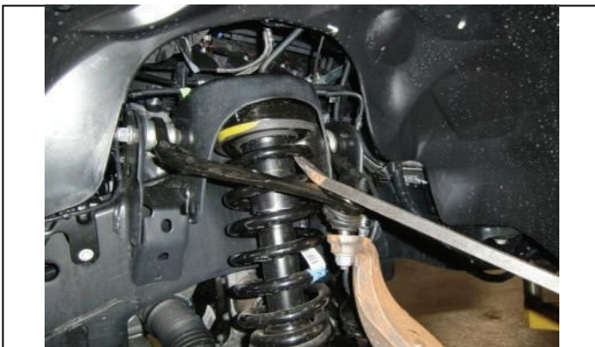
Raise suspension and reattach upper ball joint