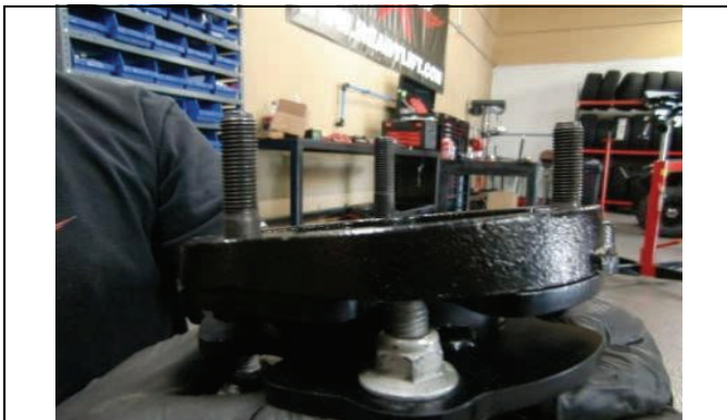
Reinstall cast spacer in original position