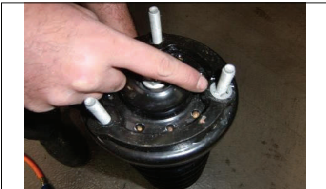
Remove coil-over, note retaining clip and remove spacer