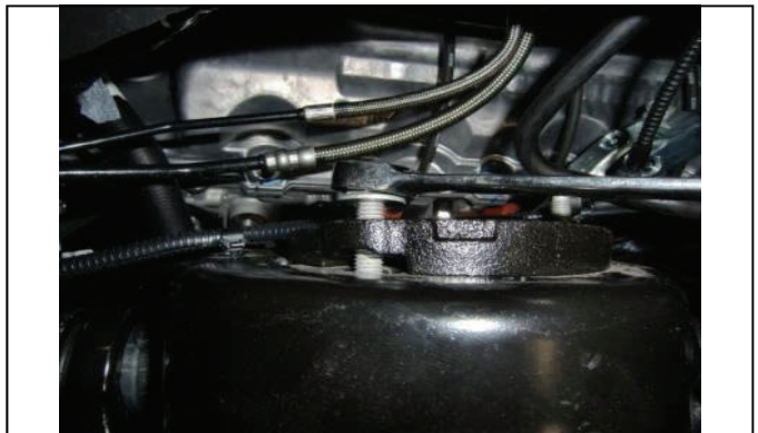
.Remove mounting nuts and note, cast spacer orientation.