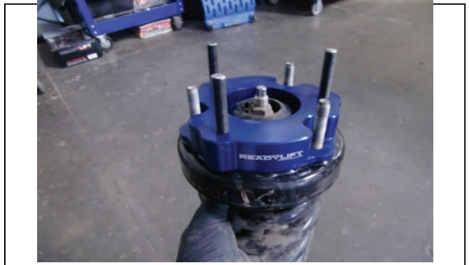
Place spacer on top of strut assembly