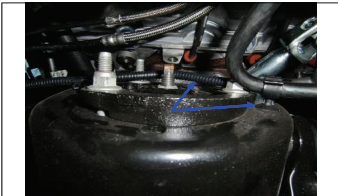
Upper coil over mount, remove clip and note wiring route.