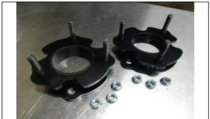
Shown, 66-2055 upper strut extension kit.