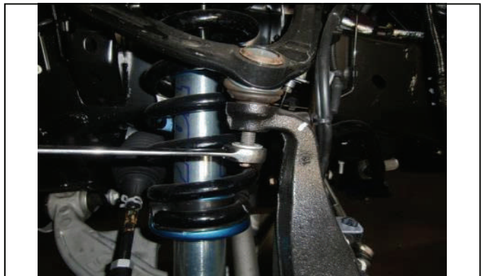
Loosen upper ball joint and leave connected.