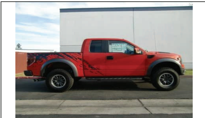
Reinstall wheels/tires lower to ground, test drive, align