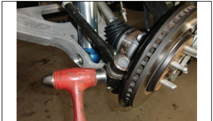
Carefully strike spindle to separate tie rod, remove nut.