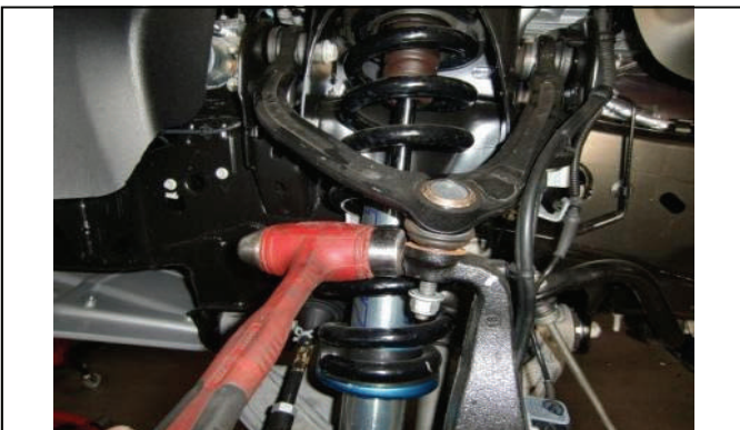
Carefully strike spindle as shown to separate ball joint