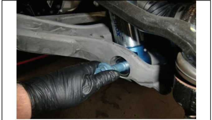
Gently tap bolt and remove lower bolt.