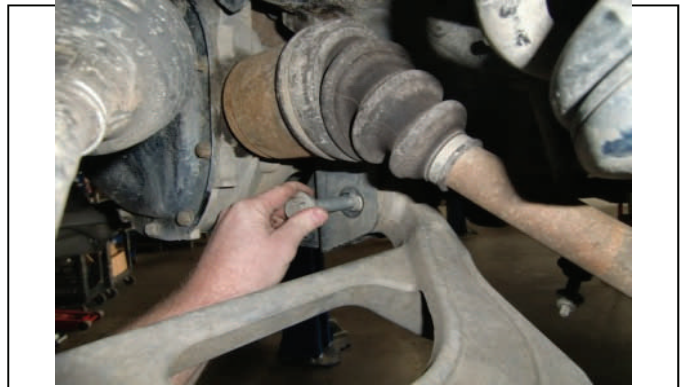
Raise LCA into frame and reattach with OE bolts