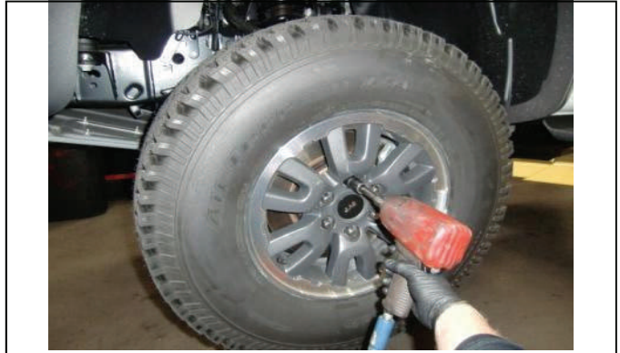
Remove front wheels.