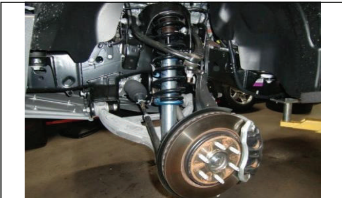
View of front suspension.