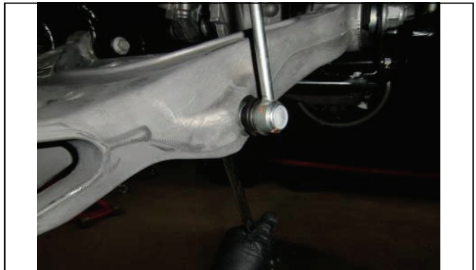
Disconnect lower sway bar end link at lower control arm.