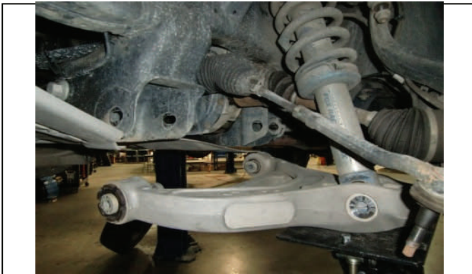
Position lower strut mount into LCA and reattach lower bolt