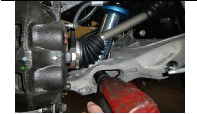
Remove lower coil over mounting hardware.