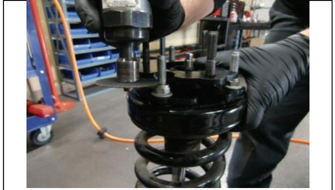
Once tightened cut OE studs flush with top of new spacer.