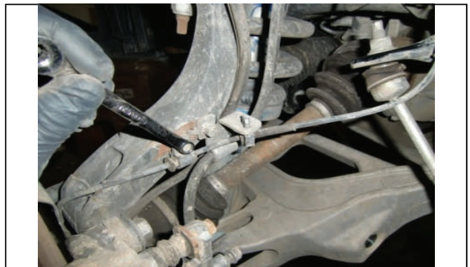
Reconnect ABS wiring, sway bar end link and outer tie rod