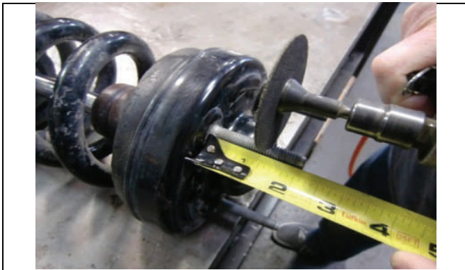
Measure and cut off OE studs flush with top of spacer