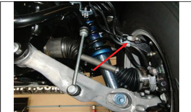
Disconnect ABS/vacuum line brackets on spindle/upper arm.