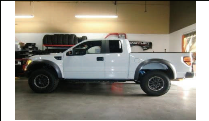
Raise and support front of vehicle on level ground.