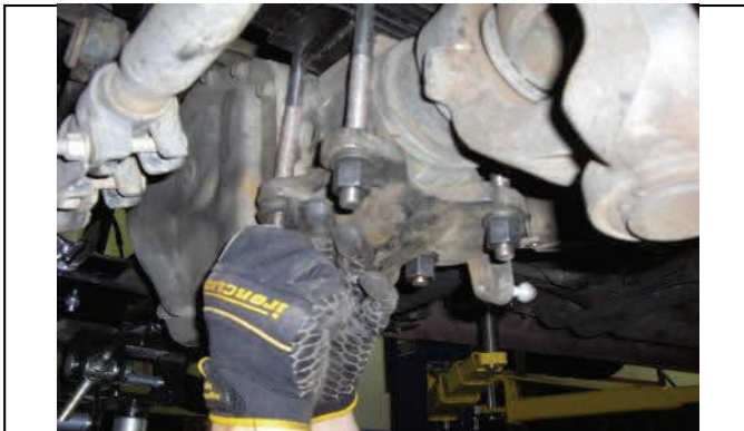
Attach lower spring plate with new hardware and tighten