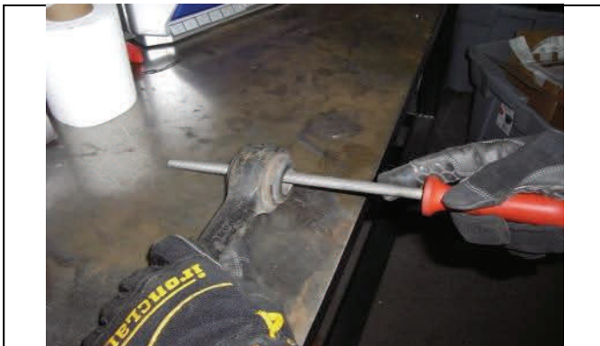
On both ends of the track bar use a file to smooth inner sleeve