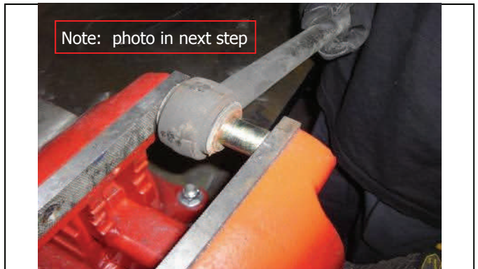
Then press new offset sleeve as shown. DO NOT HAMMER!