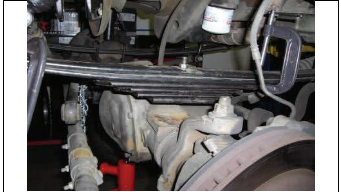
Tighten new leaf stack to OE leaves with provided nut