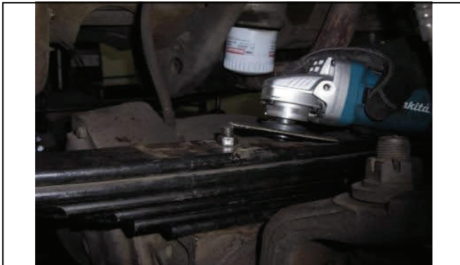
Grind excess threads to allow proper fitment of spring plate