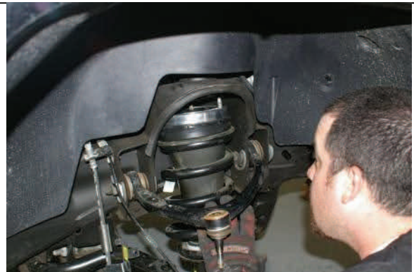
Lower suspension slightly and reinstall strut assembly