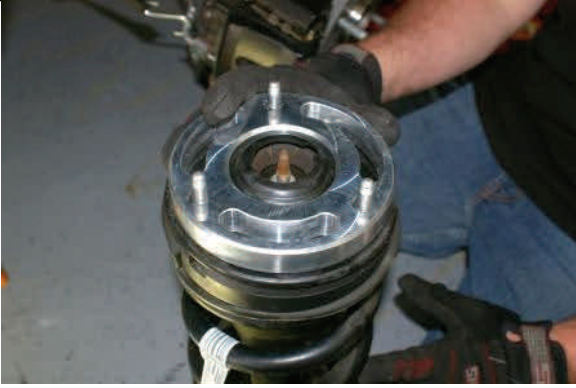
Place strut extension spacer on top of strut

Reinstall strut assembly in vehicle with the new provided hardware on top and the OE fasteners at the lower mount. Reattach the sway bar end links and ABS/brake line bracket. Note: Vehicles installing 66-3085 with the lower strut spacer perform the following steps to complete installation.