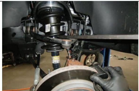
Lift suspension slightly while prying down to attach ball joint.