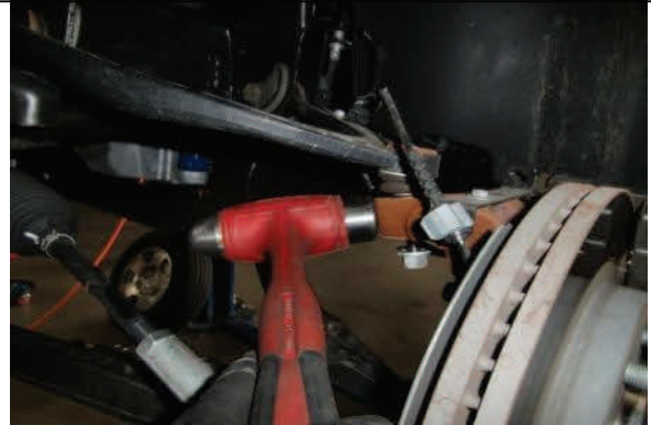
Carefully strike spindle as shown to separate ball joint.