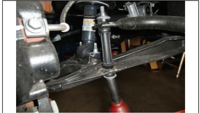
Disconnect dr/pass sway bar end links