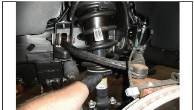
Remove entire strut assembly from vehicle.