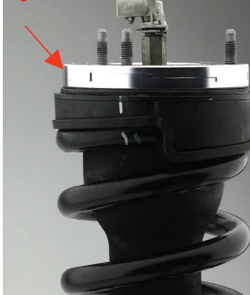
Figure 4 A-C = 1" at the wheel