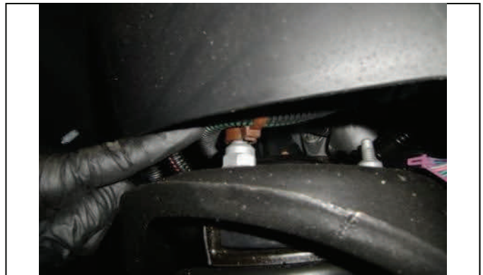
Pry up ABS retaining clips from upper strut mounting nuts