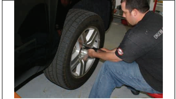
Remove front wheels/tires