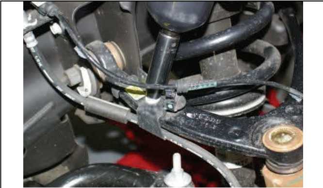
Disconnect ABS/brake bracket from upper control arm.