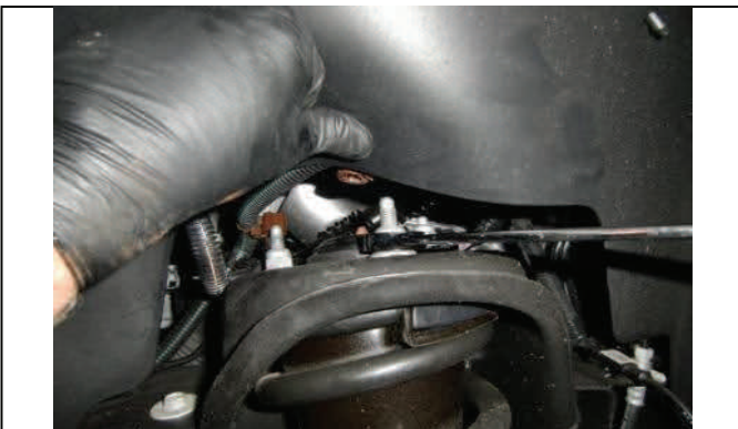
Remove upper strut mounting nuts