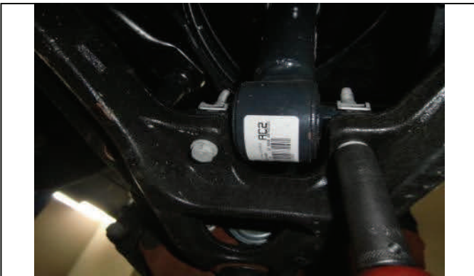
Remove lower strut mounting bolts