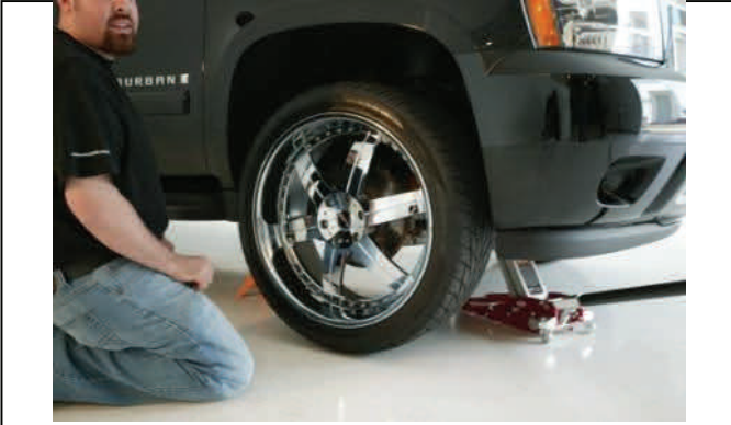
Raise and support front of vehicle frame on jack stands