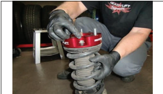
Strut assembly will be rotated 180 degrees for re-installation