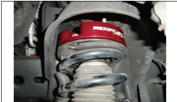
Reattach in vehicle with provided hardware and tighten

Repeat these steps on the opposite side of the vehicle. Reattach ABS/brake line brackets and tighten upper/lower coil-over mount hardware to factory specs. When completed reattach the sway bar endlinks on both sides of the vehicle simultaneously. Reinstall wheels/tires on vehicle, lower to the ground and torque to factory specs. Alignment is to be performed.