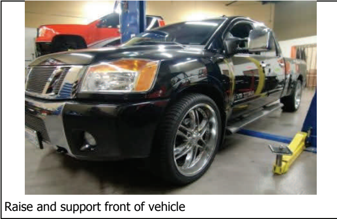
Raise and support front of vehicle