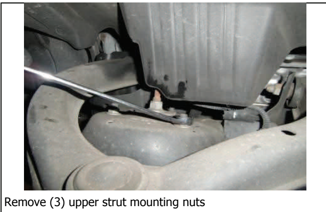
Remove (3) upper strut mounting nuts