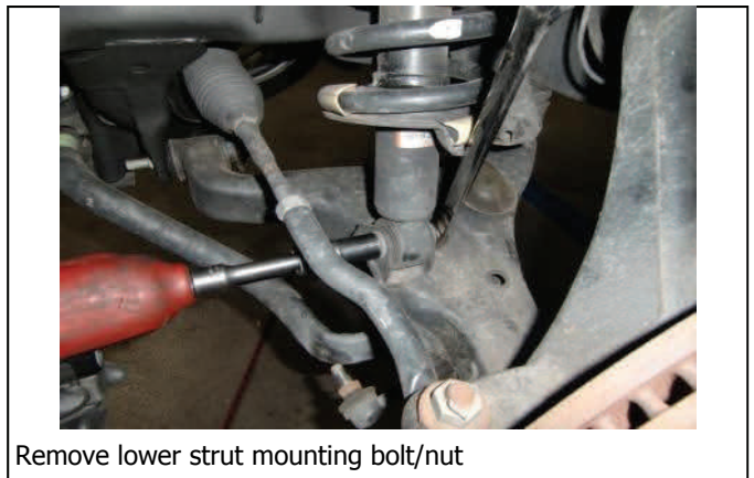
Remove lower strut mounting bolt/nut