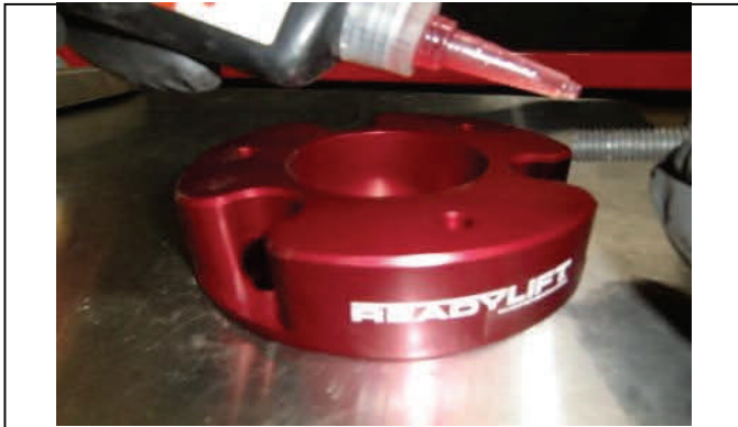
Note: Use thread locker to install studs in spacer