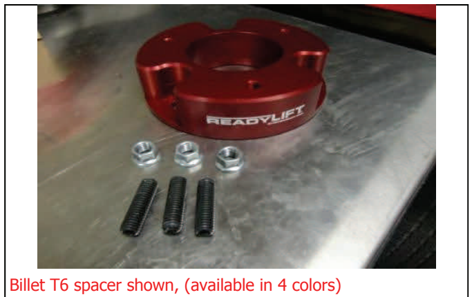
Billet T6 spacer shown, (available in 4 colors)