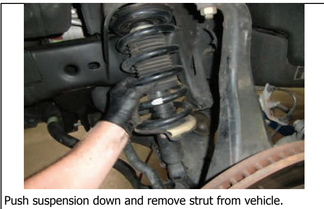
Push suspension down and remove strut from vehicle.