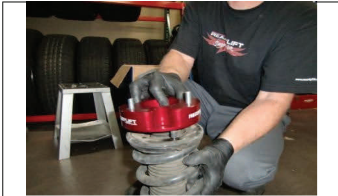
Attach spacer to top of strut with OE nuts and tighten