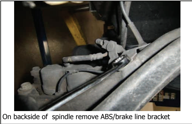
On backside of spindle remove ABS/brake line bracket