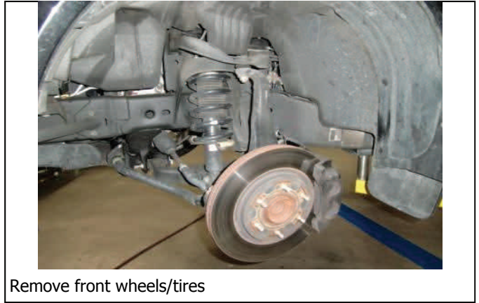
Remove front wheels/tires