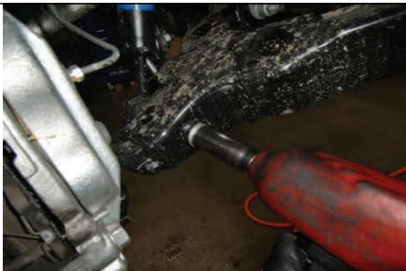
Reattach and tighten lower strut mounting hardware