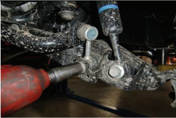
Disconnect lower sway bar end links