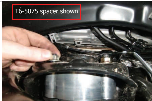
Reattach upper strut mount with provided nuts and tighten