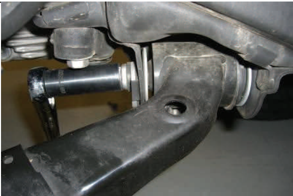
Loosen both lower control arm pivot/alignment bolts