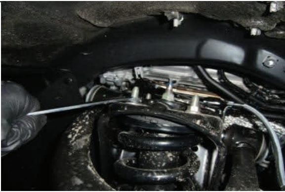
Remove upper strut mounting hardware