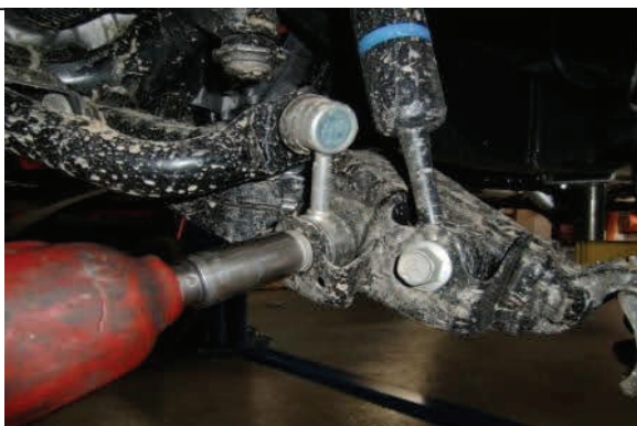
Reinstall wheels/tires, lower vehicle, reattach sway bar ends

**Tighten lower control arm bolts check all work, test drive and have vehicle aligned 4WD models only: Remove front skid plate from vehicle. Next, place a jack/support under front differential. Remove the (2) front differential mounting bolts. Lower the differential enough to allow installation of the (2) 1" spacers between the frame and the mounts. Install the provided longer bolts and nuts w/ the OE washers. Torque to factory spec. Then reinstall the factory skid plate with the provided 1/2" tall spacers and longer bolts in the front mounting locations. See photos below.