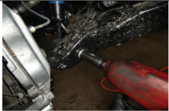
Remove lower strut mounting hardware