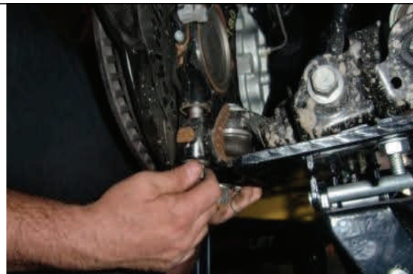
Raise lower control arm, reattach (2) ball joint mounting bolts