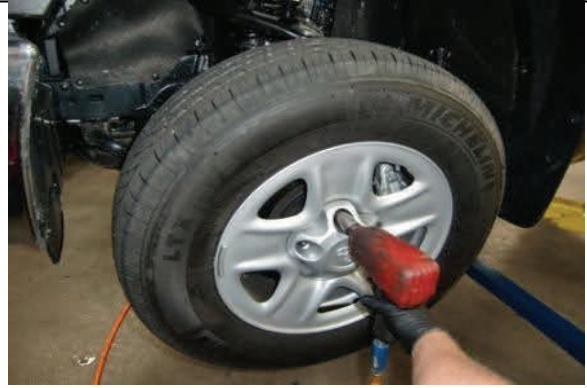
Remove front wheels/tires