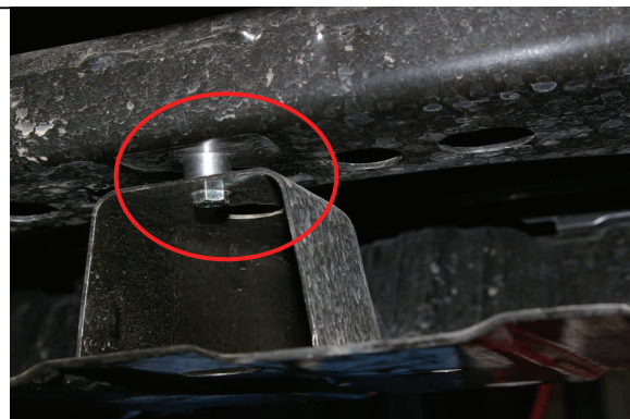
Install (2) skid plate spacers with new hardware