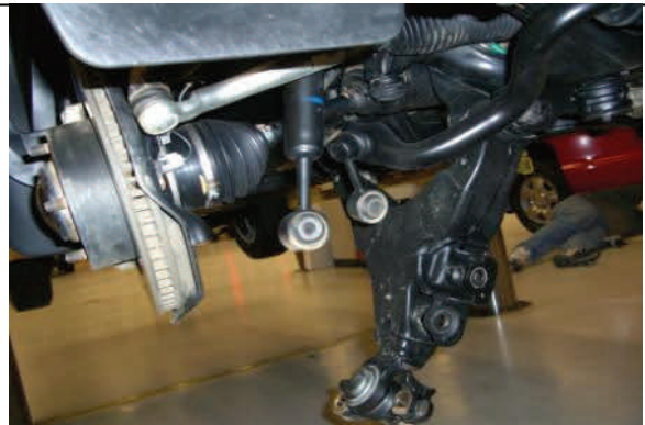
Swing down lower control arm and remove strut