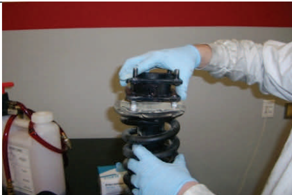
Attach strut extension spacer with OE mounting hardware