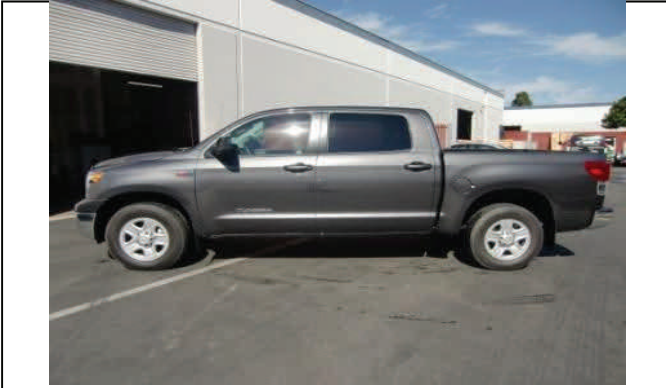
Raise and support front of vehicle by frame