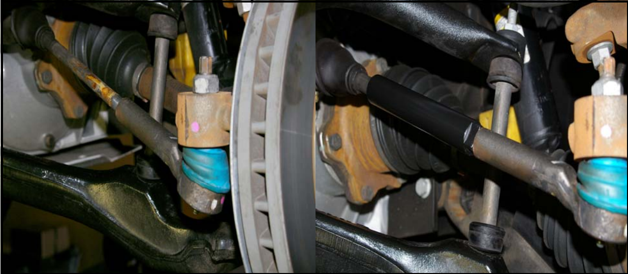
Before ReadyLift® Tie Rod Support Kit

Wheel Alignment; a Certified Alignment Technician that is experienced with lifted vehicles is recommended to perform the alignment. *It is recommended that you have your vehicle's alignment checked whenever installing suspension parts. *It is also recommended that you adjust your headlights whenever your vehicle's ride height is altered.