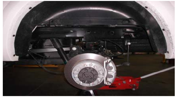
22. Lift the vehicle by the frame, support the axle, and remove the wheels.