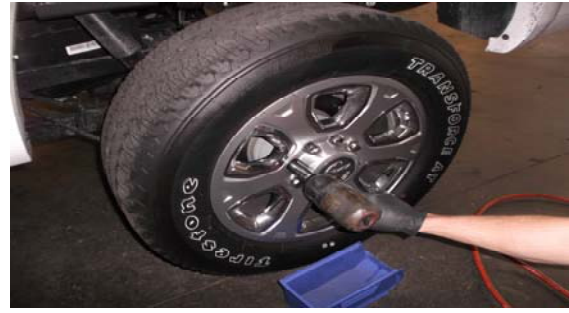
30. Reinstall the rear wheels.