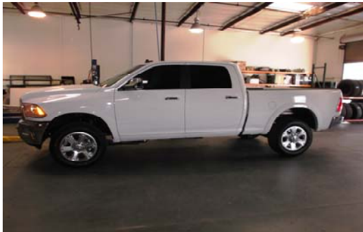
1. Front Install: Place the vehicle on level ground.

The Bill of Materials represents the component contents of this kit. All hardware is of the highest grade and the components are manufactured to exacting specifications for a trouble free installation. Use the attached torque specifications chart when final tightening of the nut and bolts are done.