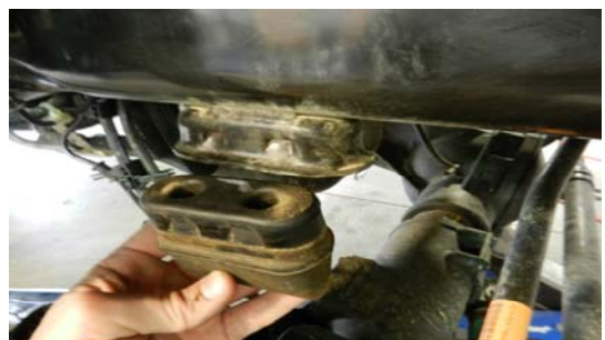
10. Remove the factory bump stops from the frame.