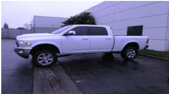
31. Lower the vehicle to the ground and torque the lug nuts.

Note: Double check all worked performed on the vehicle to ensure correct installation.