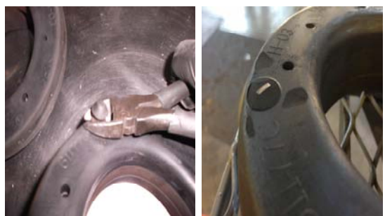
12. On OE spring isolator, cut off the rubber locating tab.