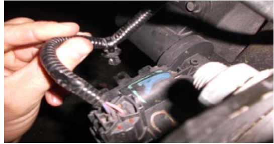
6. Unhook the wheel speed sensor wire line from the mount on the passengers side of the axle.