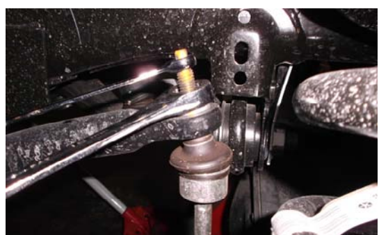
4. While front axle is supported, remove the sway bar end links.