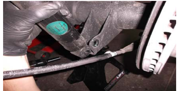
24. With the axle supported, unbolt the shocks from the axle.