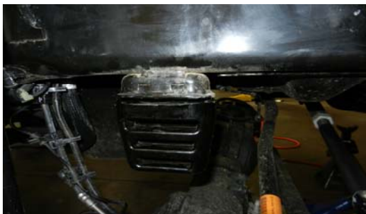
11. Install the ReadyLift 3" bump stops.