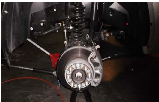
3. Remove the front wheels.