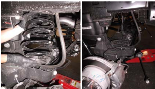
25. Lower the axle until the springs are loose enough to remove.