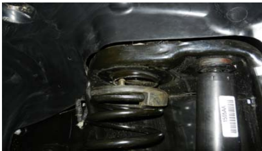
9. Lower the axle down to allow the front coil springs to be removed.