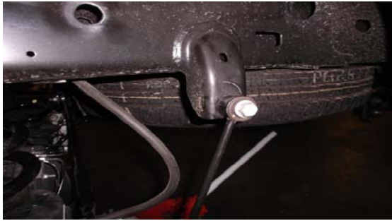
29. Reinstall the sway bar end links.