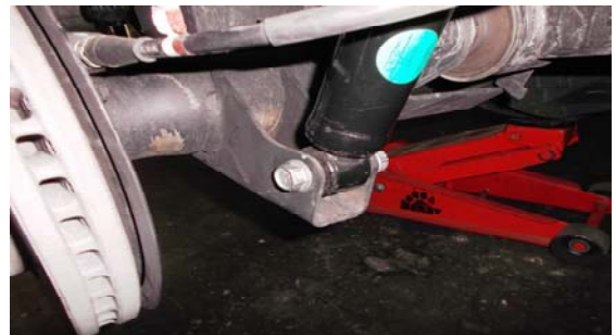
28. Jack the axle back up to weight the springs then install the shocks.