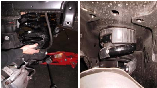
27. Reinstall the coil spring with the spacer.