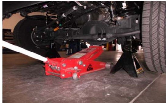
2. Lift the front of vehicle by the frame, then support the axle.