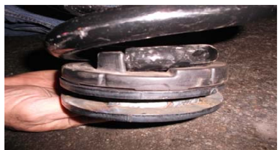
26. Place the coil spacer under the lower spring isolator.