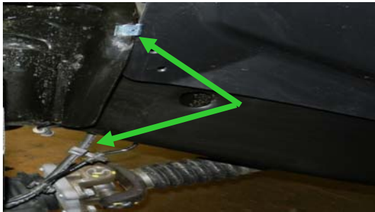
7. Unhook the differential breather tube from inside the frame.