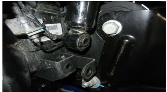
8. Unbolt the front shocks from the axle. Leave the tops bolted.