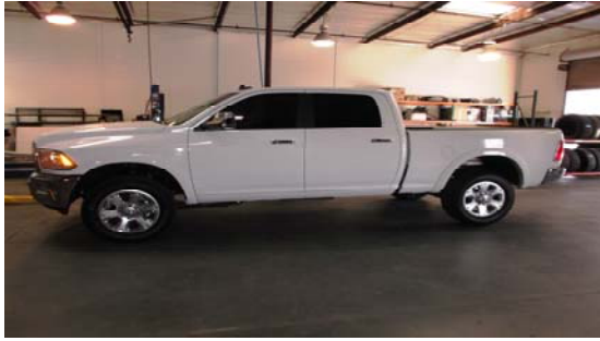
21. Rear Installation: Place the vehicle on level ground.