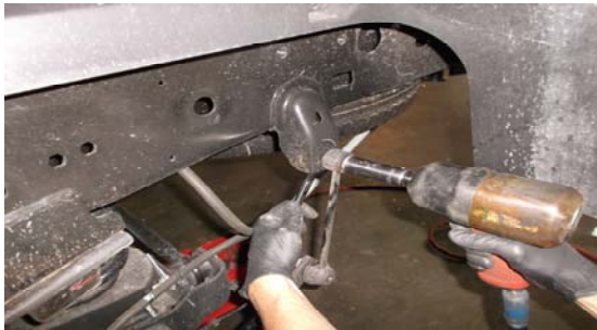
23. Unbolt the sway bar end links.