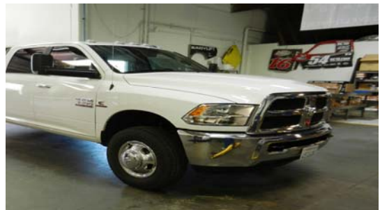
20. Torque the front wheels to factory specs.