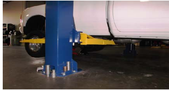
22. Lift the rear of the vehicle off the ground by the frame.