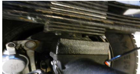
26. Lower the axle to make room to install the lift block.