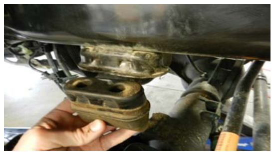
10. Remove the factory bump stops from the frame.