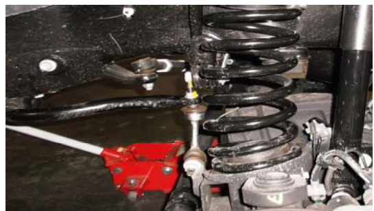
18. Reinstall the sway bar end links.