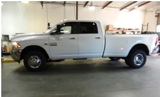
1. Front Install: Place the vehicle on level ground.

The Bill of Materials represents the component contents of this kit. All hardware is of the highest grade and the components are manufactured to exacting specifications for a trouble free installation. Use the attached torque specifications chart when final tightening of the nut and bolts are done.