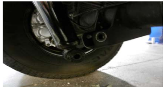
24. Unbolt the shocks from the frame and axle, then remove.