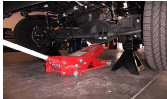
2. Lift the front of vehicle by the frame, then support the axle.