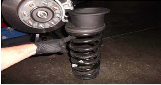
13. Install the OE spring isolator and the strut spacer onto the coil spring. Lower the axle further to allow spring installation.