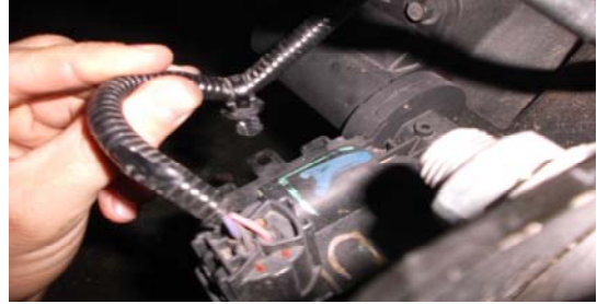
6. Unhook the wheel speed sensor wire line from the mount on the passengers side.