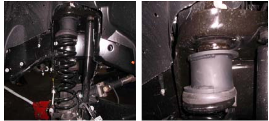
14. Install the assembly in to the vehicle. Note: Coil Spacer position. Coil Spacer Should be orientated so the spring is offset to the front of the coil pocket and to the inside of the frame to correct "Spring Bowing"