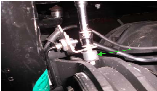
17. Install the brake line spacers using the longer bolts provided.