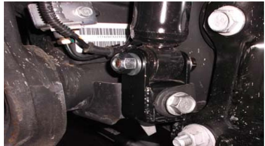
16. Install the shock extensions.