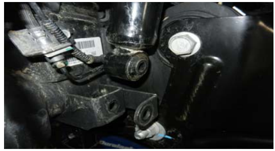
8. Unbolt the front shocks from the axle. Leave the tops bolted.