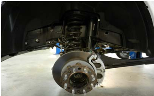
3. Remove the front wheels.