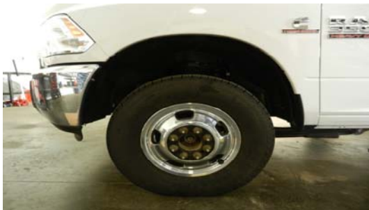
19. Reinstall the front wheels and put the vehicle on the ground.