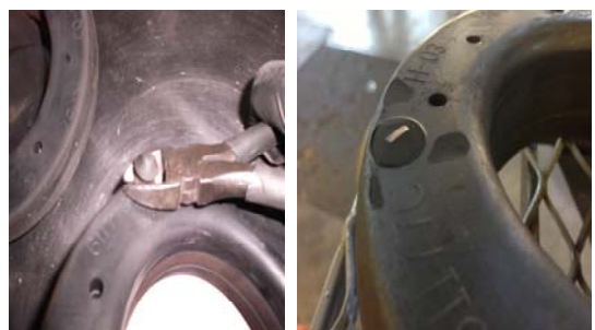
12. On OE spring isolator, cut off the rubber locating tab.