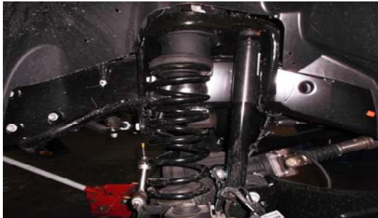
15. Raise the axle to weight the springs.