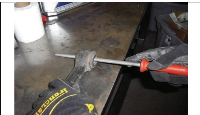
On both ends of the trac bar use a file to smooth inner sleeve