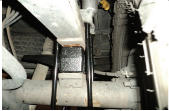
Raise axle and secure block with new u-bolts and hardware.

Make sure block pins are aligned properly in axle and leaf pack. Align u-bolts and tighten, perform the following steps on the opposite side. Lower vehicle to ground and torque u-bolts to factory specs. Double check all work and test drive vehicle. Have your vehicle aligned and enjoy.