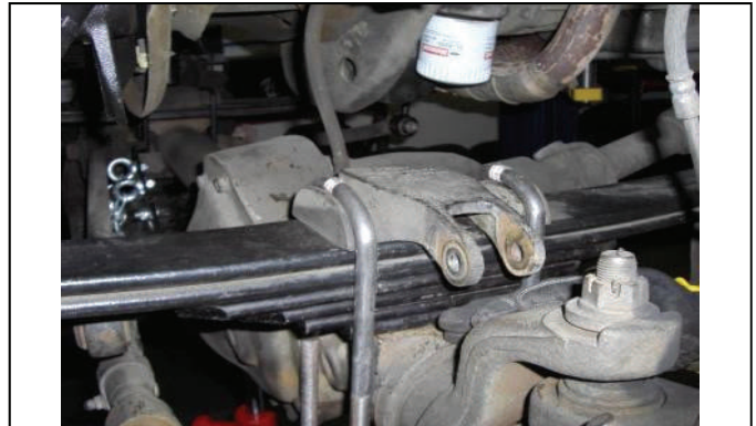
Replace spring plate with new longer U-bolts