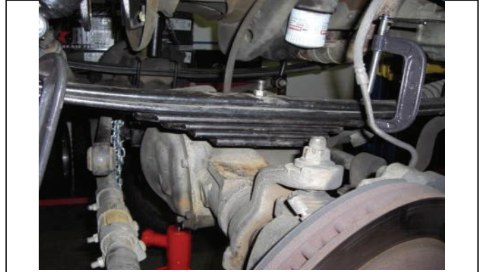
Tighten new leaf stack to OE leaves with provided nut