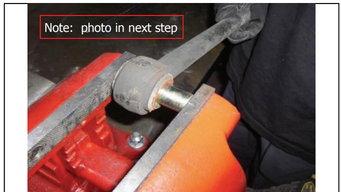
Then press new offset sleeve as shown. DO NOT HAMMER!