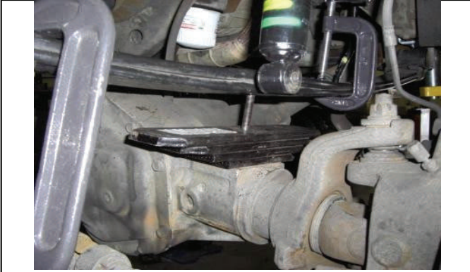
Remove nut from new center bolt and place into position