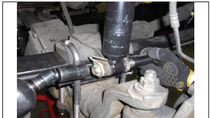
Reinstall lower shock into original position with OE hardware