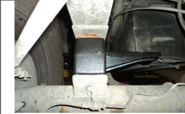
Remove OE axle block and replace w/ new lift block.