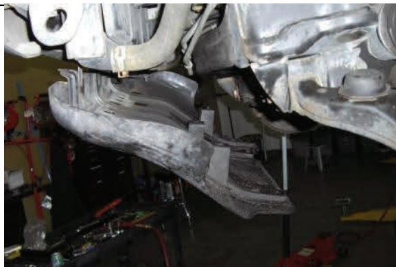
4WD models remove front skid plate