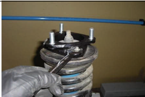
Attach assembled spacer to top of strut w/ OE hardware