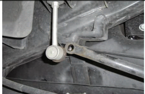
Disconnect lower sway bar endlinks