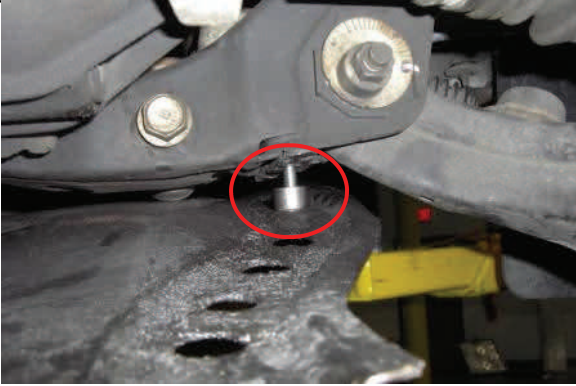
4WD Reattach skid plate with provided spacers and hardware

Reinstall lower strut mounting hardware and torque. Raise suspension and reconnect upper ball joint and tighten, replacing the retaining clip, the reattach both ABS/brake line brackets. Sway bar end links can be done simultaneously once both sides are complete. Recheck all work and check for tire clearance between the upper control arm.