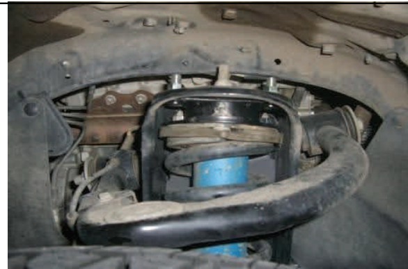
Rotate strut 180 degrees & reinstall with provided hardware