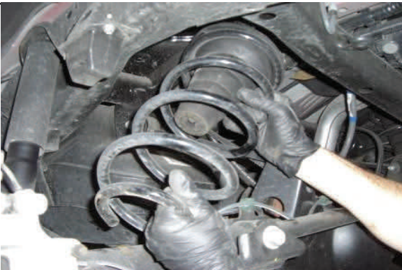
Carefully lower axle enough to remove coil spring