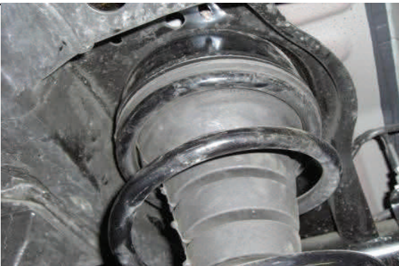
Reinstall into vehicle and raise axle