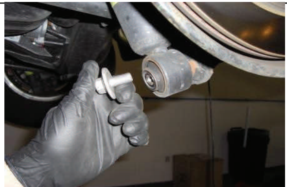
Reconnect and tighten lower shock and sway bar endlinks