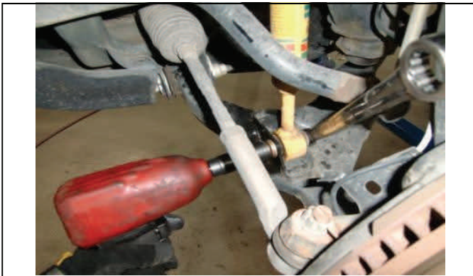
Remove lower strut mounting hardware