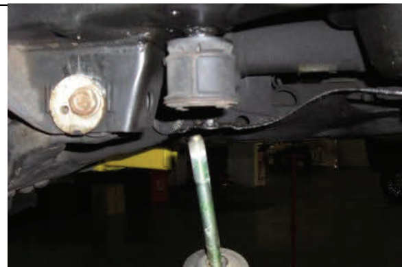
4WD Support differential & remove front mounting hardware