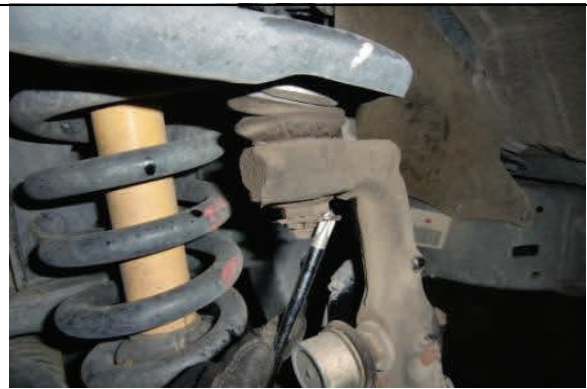
Remove Upper ball joint retaining clip