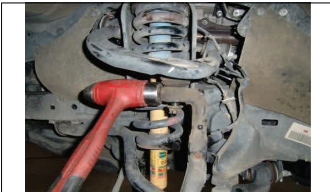
Loosen upper ball joint nut and strike to disconnect