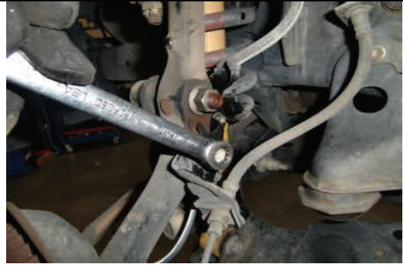
Disconnect ABS/brake line bracket at spindle