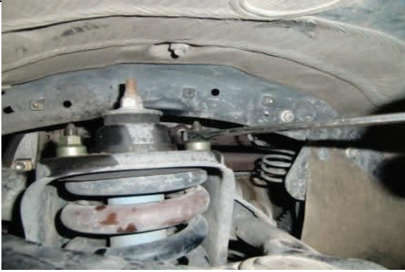
Remove upper strut mounting hardware