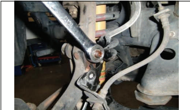
Disconnect sway bar end link at spindle