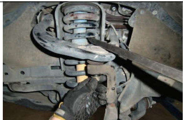
Support suspension and remove upper ball joint nut