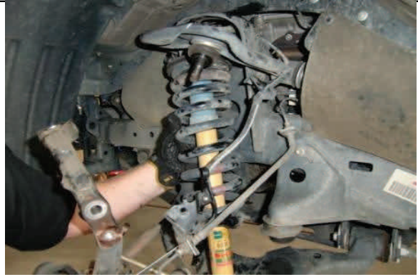
Remove strut assembly from vehicle