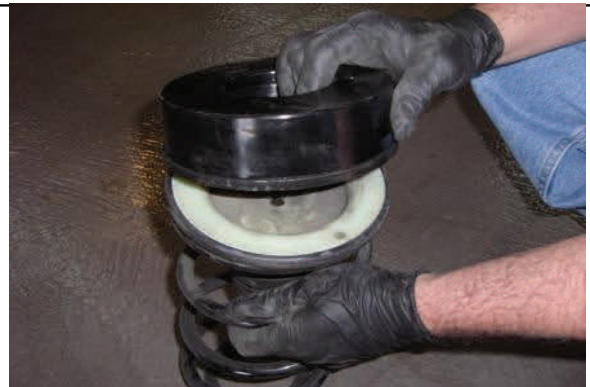
Place coil spacer on top of bump stop on coil spring