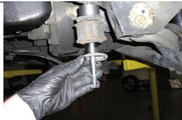
4WD Install longer bolts and reattach differential to frame