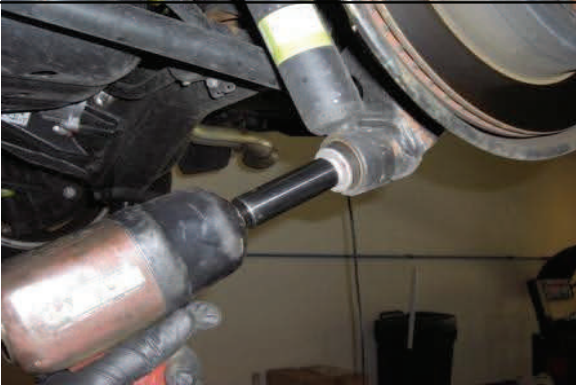
Support rear axle and disconnect lower shock mount.

Rear Installation: Take caution during installation to ABS/brake lines .