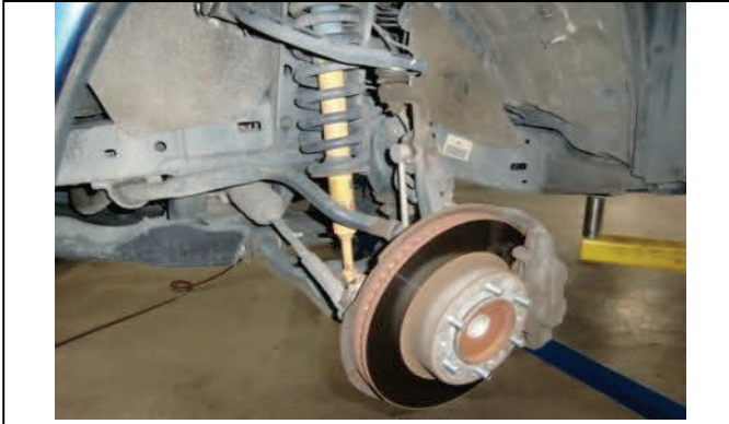
Raise and support vehicle on frame