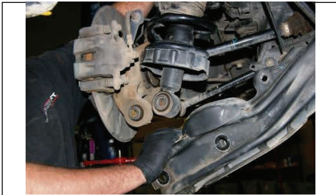
Push down lower control arm, lift strut up and out