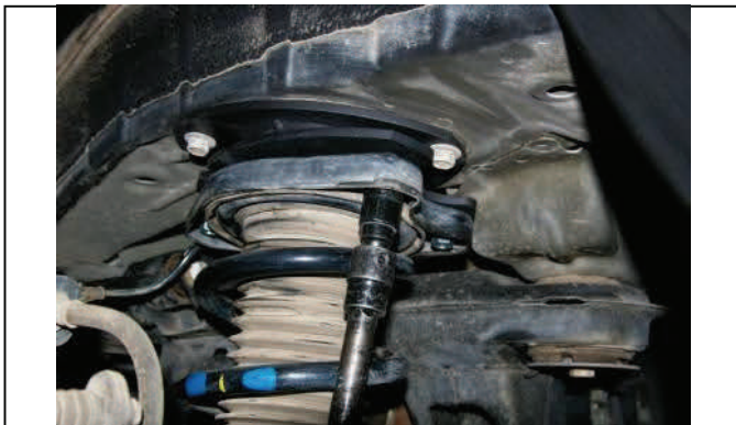
Reinstall strut into vehicle and attach with new nuts