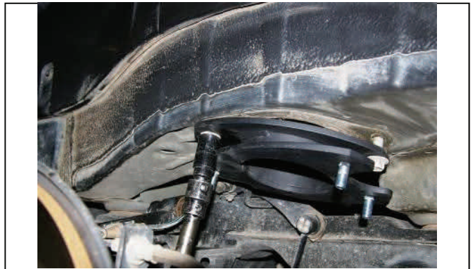
Attach rear spacer to vehicle with OE hardware