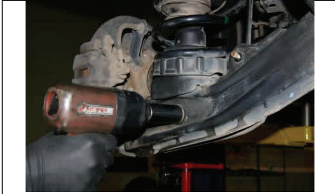
Unbolt lower strut mounting hardware