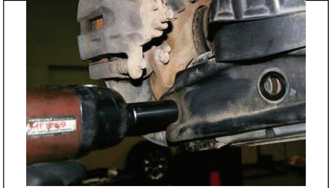
Unbolt lower control arm from spindle