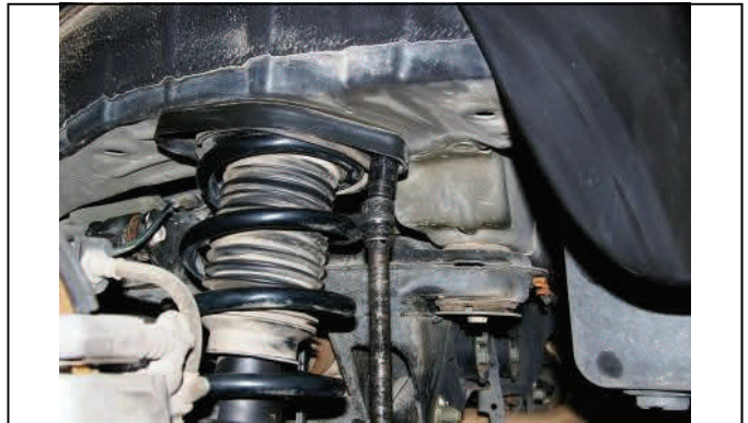
Unbolt upper strut mounting bolts from unibody