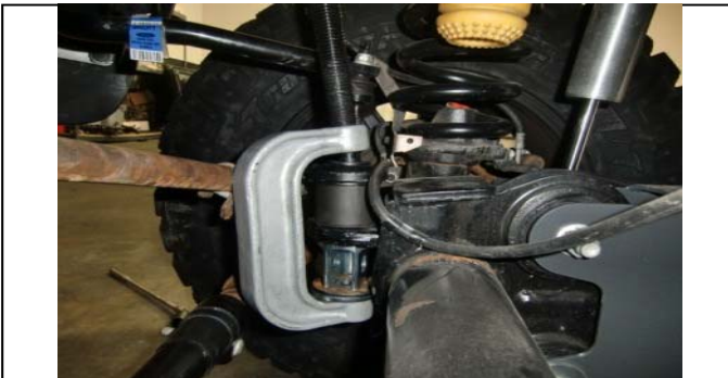
Use press tool to draw clevis into position