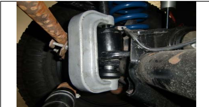
Shown, tool set positioned to remove ball joint