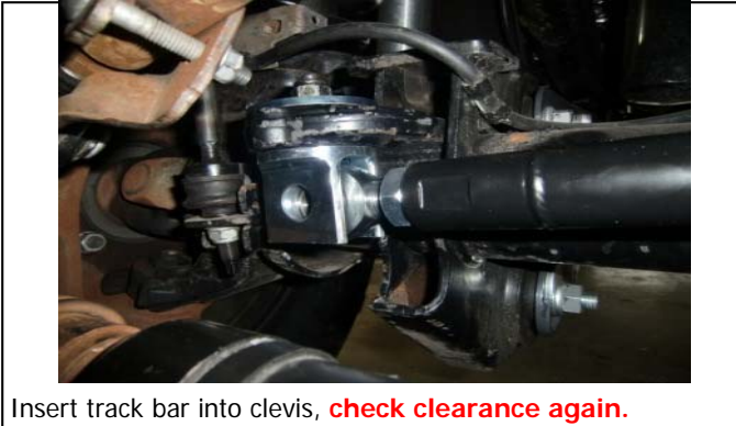
Insert track bar into clevis, check clearance again.