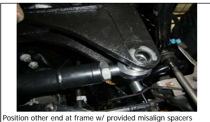
Position other end at frame w/ provided misalign spacers