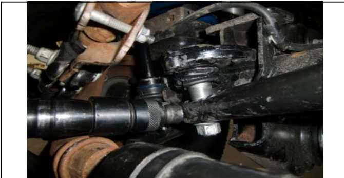
Use ball joint fork/air hammer to separate bar from ball joint