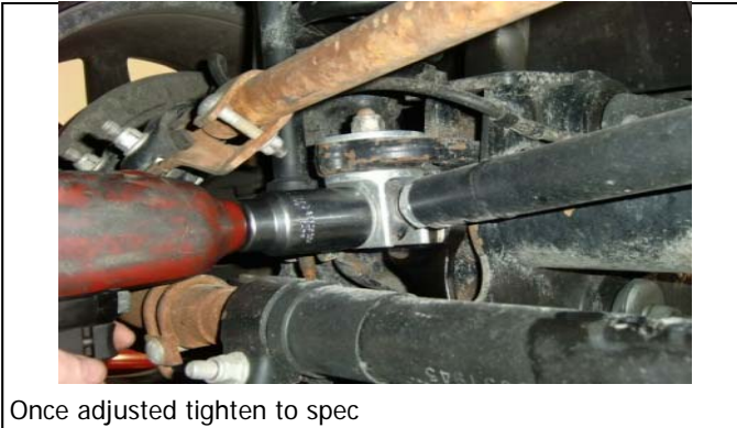
Once adjusted tighten to spec