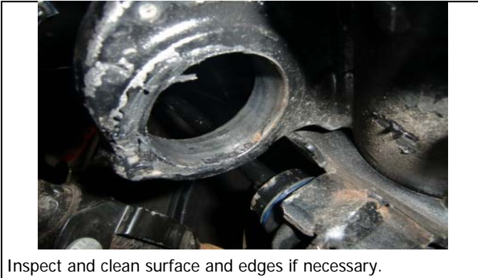
Inspect and clean surface and edges if necessary.

Please Note: For "stock" vehicles and front end lifts up to 4" we recommend the bent bar be installed with the clevis pressed in from the bottom. For vehicles with 4" and more the straight bar can be mounted with the clevis pressed in on the top. Moreover, with the presence of an aftermarket track bar relocation bracket and or drop pitman arm, it is recommended the new track bar and clevis be installed so that the track bar is positioned as parallel to the drag link as possible.