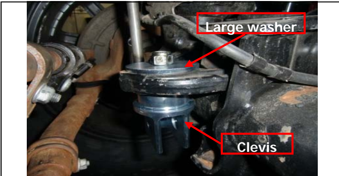
Position clevis in place w/socket head bolt, washer and nut

Please Note: For "stock" vehicles and front end lifts up to 4" we recommend the bent bar be installed with the clevis pressed in from the bottom. For vehicles with 4" and more the straight bar can be mounted with the clevis pressed in on the top. Moreover, with the presence of an aftermarket track bar relocation bracket and or drop pitman arm, it is recommended the new track bar and clevis be installed so that the track bar is positioned as parallel to the drag link as possible.