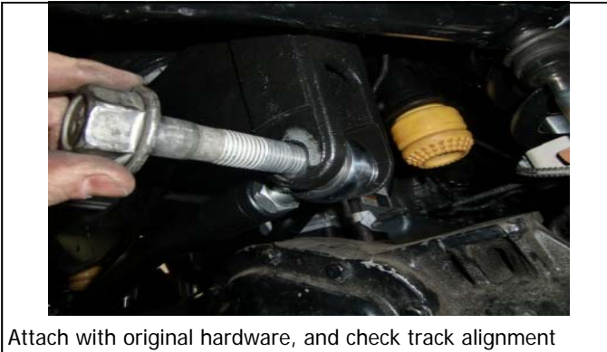
Attach with original hardware, and check track alignment