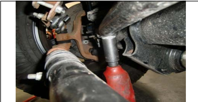
Loosen ball joint nut and leave attached