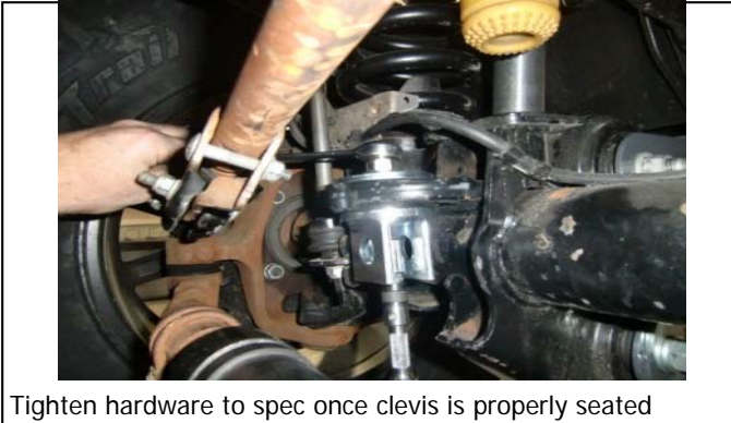
Tighten hardware to spec once clevis is properly seated