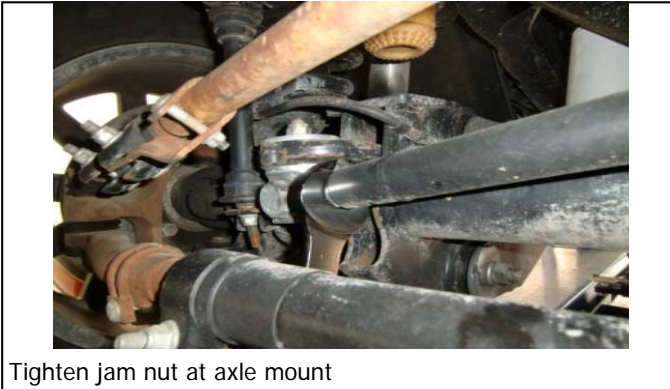
Tighten jam nut at axle mount