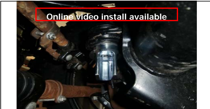
Mark clevis to axle and insert track bar to ensure proper fit.