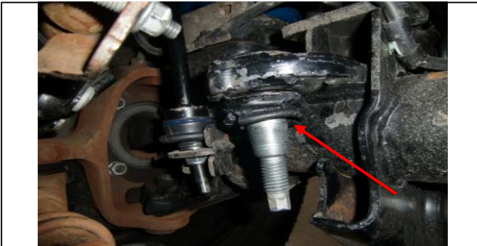
Shown, ball joint to be removed