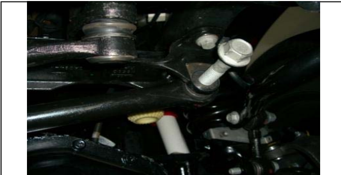
On opposite end disconnect hardware and remove bar