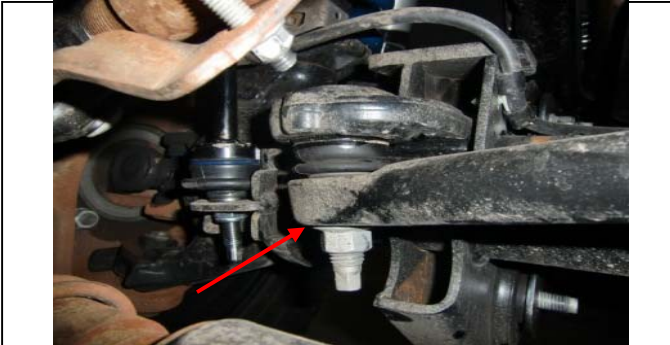
Shown, OE ball joint mount pass. Side axle mount.