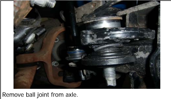
Remove ball joint from axle.