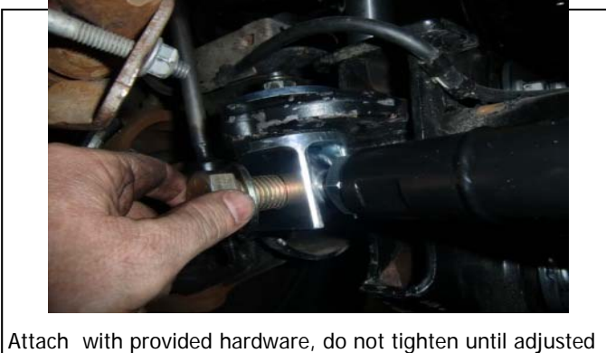
Attach with provided hardware, do not tighten until adjusted