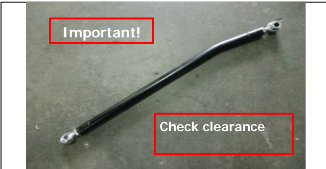
Use assembled track bar as a guide to ensure proper position