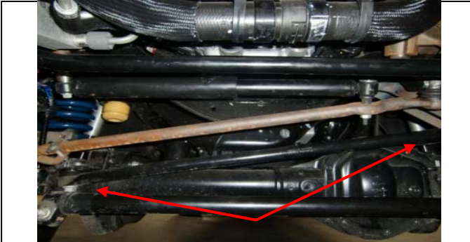
Front view of suspension, Track bar attaches to frame & axle