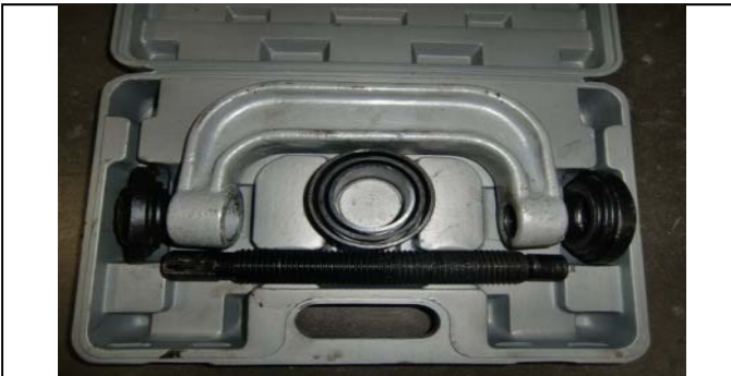
Use proper heavy duty ball joint removal tool set.