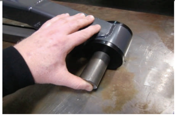
Lube pivot pin and install into bushings