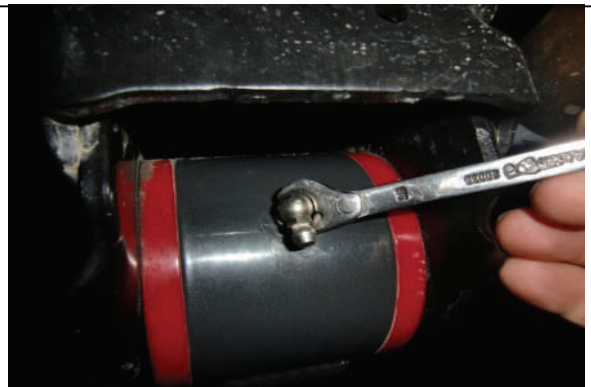
Install provided zerk fittings and reconnect ABS/vacuum lines

Lower vehicle onto it's own weight and torque radius arms hardware to spec and set alignment cams to neutral position. Test drive and have vehicle aligned.