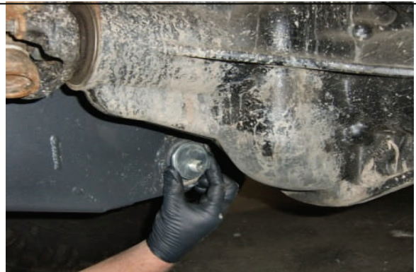
Install new offset cams/bolts/nuts into front lower mount