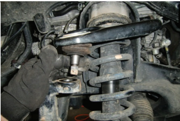
Disconnect upper ball joint and separate from UCA