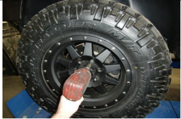
Reinstall wheels/tires and lower vehicle to ground