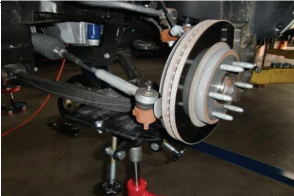
Support lower control arm with floor jack