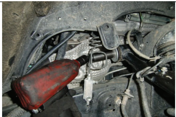
At the frame loosen & remove UCA pivot mounting hardware