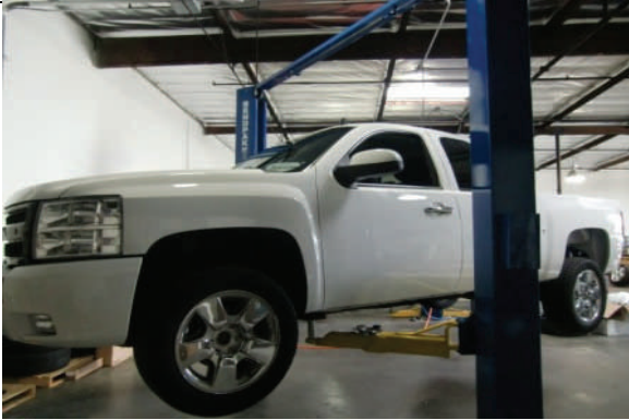
Securely lift front of vehicle and support frame