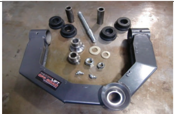
Assemble your new OFF-Road Series UCA with hardware kit