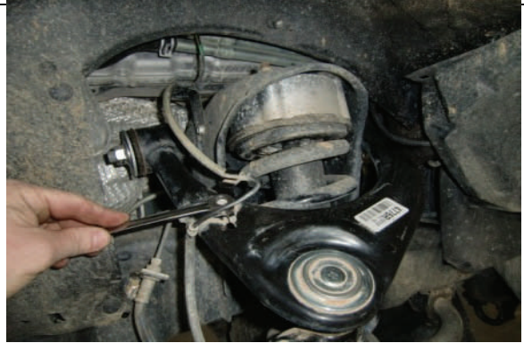
Disconnect any ABS wiring attached to UCAs