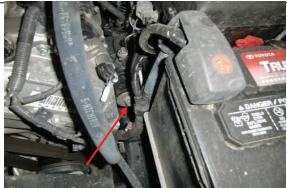
Photo shows UCA mounting bolt and battery proximity